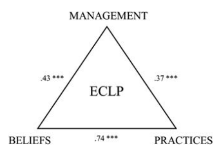
Figure 1. Correlations (p < .001) of the three sides of the ECLP triangle.

to .74 between beliefs and practices (Figure 1). As our measurement theory predicted the three measures to be positively associated with one another, a certain degree of nomological validity could be established. Ultimately, a minor and theoretically justifiable alteration was made to fine-tune the measurement model (Arnau & Thompson, 2000). More specifically, we allowed one pair of measurement errors to covary, as suggested by the modification indices. It was indeed plausible that the error terms of 'I greet multilingual parents in their home language' and 'I speak to multilingual parents in their home language' were correlated as the formulation as well as the meaning of both items were not entirely dissimilar. Therefore, the permission of within-construct error variance posed no threat to the proposed theoretical structure. A visual diagram depicting the modified model is displayed in Figure 2. The rectification resulted in a slightly better fit with the data, \chi^2 (100) = 153.94, p < .001; CFI = .94; RMSEA = .06; SRMR = .057. The latter model could have been further refined by adding more correlation error terms. Nevertheless, without solid theoretical justification, this may have led to acceptance of a new model while concealing a more meaningful theoretical structure, and is often advised against (Gerbing & Anderson, 1984; Kline, 2011). Therefore, no other (unnecessary) modifications were carried out (Table 4).